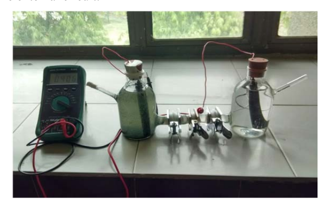
Fig. 2: Constructed Prototype of MFC

Constructed prototype of MFC consisted of the following four parts: (1)Anode chamber (Left chamber): which holds the carbon electrode, waste water (consisting of bacteria and organic matter) in an anaerobic environment, (2)Cathode chamber (Right chamber): which holds carbon electrode, a conductive saltwater solution; (3)Proton Exchange Membrane (Nafion-117), which separates the anode and cathode and allows protons to move between the two chambers and (4) an external circuit, which allows a path for electrons to travel from anode to cathode. In the present work, open circuit voltage is measured with the multimeter which is connected in the external circuit.